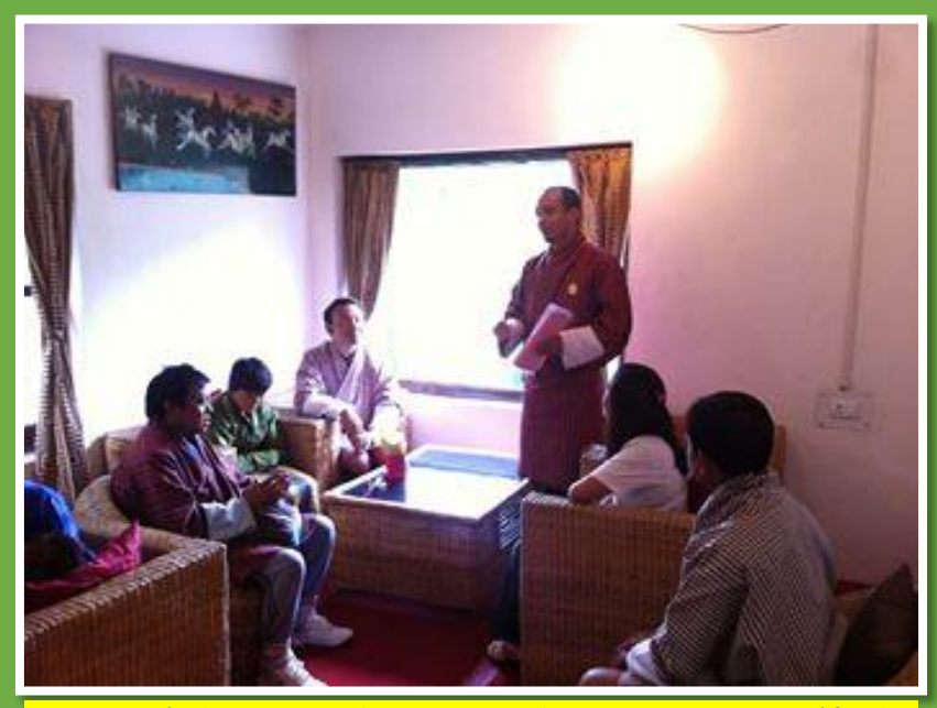
Figure 9: BKF's Chairperson explaining on transplant treatment to patients' families

In keeping with the command of His Majesty the King to save the lives of 5 dialysis patients presented during the audience on 8<sup>th</sup> August, the Foundation called for a special meeting with the immediate family members of the patients on 1<sup>st</sup> September.