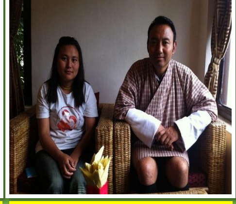
Figure 10: Patients' family members at the meeting