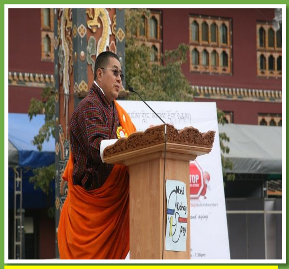
Figure 1: Honorable Health Minister gracing the event

The Bhutan Kidney Foundation in collaboration with the Royal Institute of Health & Science (RIHS) observed the first ever World Kidney Day on 13th March 2014 at the Clock Tower Square, Thimphu.