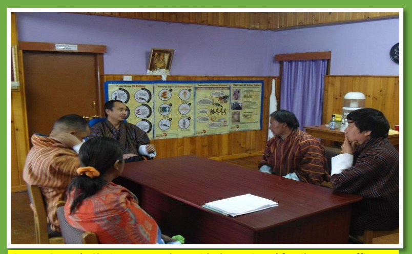
Figure 13: BKF's Chairperson and ED with the patients' family at BKF office

As a follow up to the meeting conducted with 5 patients