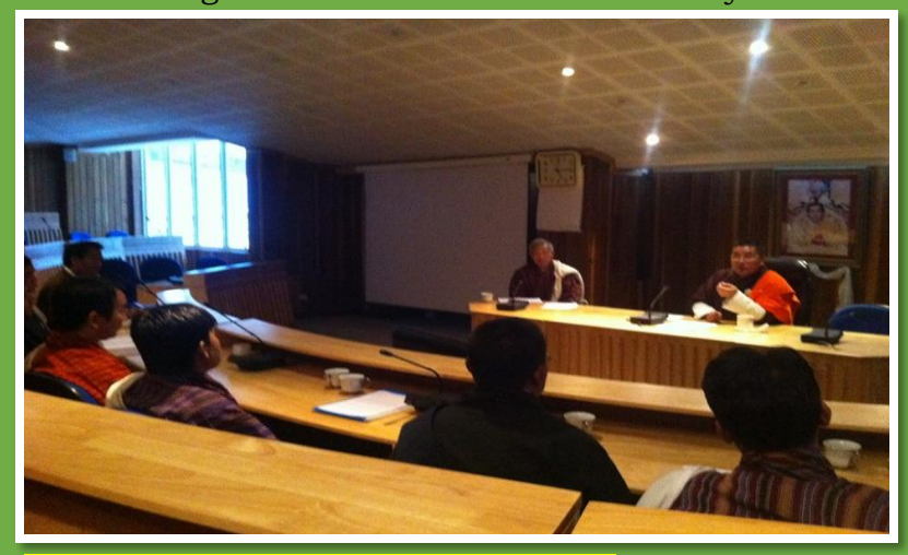
Figure 12: Hon'ble Minister addressing the participants

The meeting discussed on the areas and ways that BKF