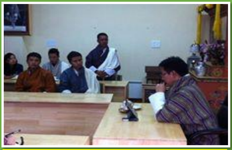
Figure 8: A participant (patient) apprising general issues on kidney to Hon'ble Minister

Affairs, Lyonpo Damcho Dorji at National Resources Development Corporation Limited Conference hall.