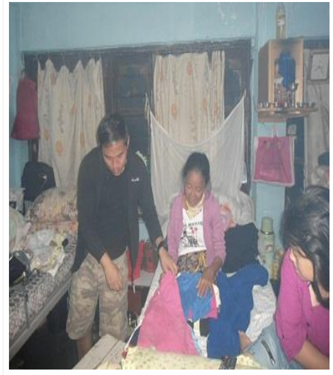
Figure 20: Few of the beneficiaries after the support from BKF

As a result of contributions made by individuals and groups, BKF is able to support patients and children with support such as clothes and school shoes.