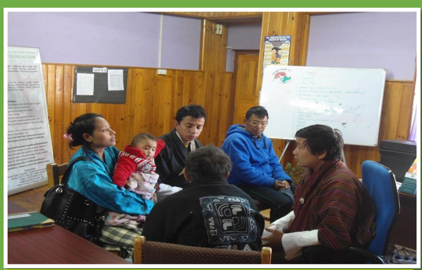
Figure 14: BKF's Executive Director counseling patient's family

The Foundation aspires to outreach the patients and their family on imparting knowledge to combat the disease in every possible measure.