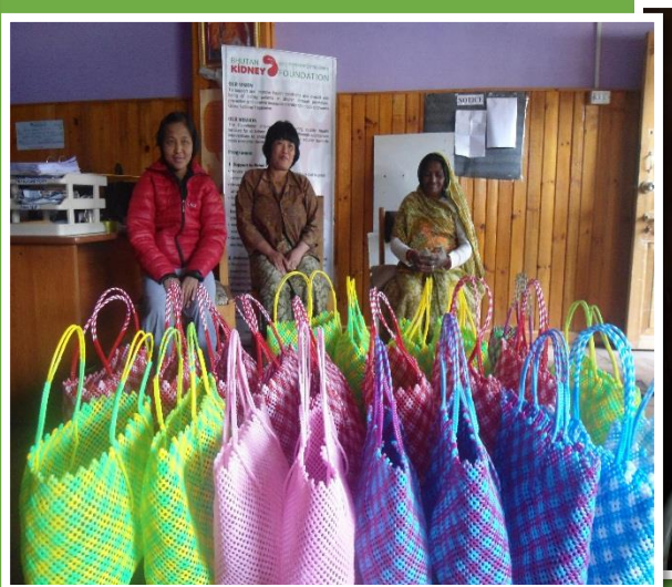
Figure 23: Patients & attendants with their produce

BKF also do the promotion and selling of their end produce.