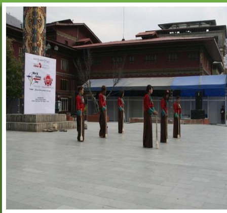
Figure 2: Public in queue to avail medical facility Figure 3: A group of dancer supporting the event

Free medical checkup such as Blood Pressure, Random Blood Sugar and Body Mass Index were facilitated to the general public where an approximate of 453 people turned up to avail the services.