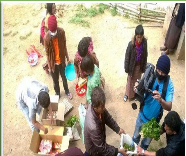
Figure 16: Supply of groceries at the PGH, Thimphu

The BKF as a support group actively intervenes in this areas thus coordinates and look for compassionate individuals and groups for the supply of groceries to patients while the foundation supply in absence of any suppliers.