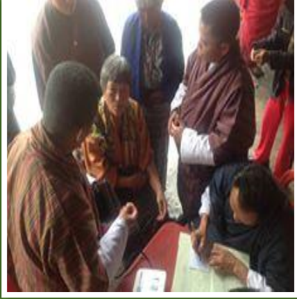
Figure 4: Kidney patients lighting the butter lamps