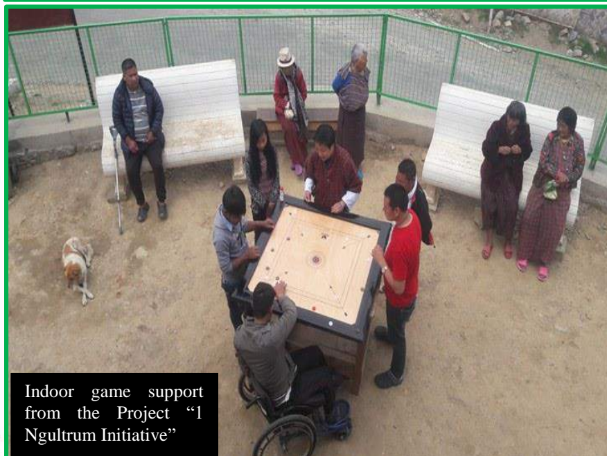
Indoor game support from the Project “1 Ngultrum Initiative”