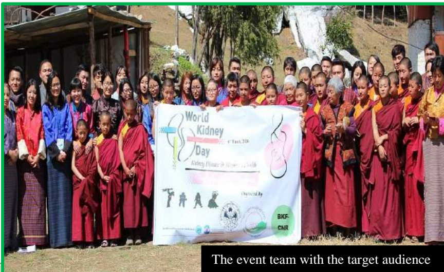
The event team with the target audience