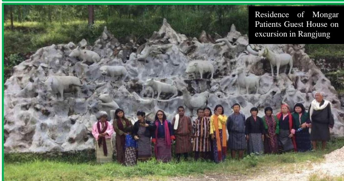
Residence of Mongar Patients Guest House on excursion in Rangjung

This activity was found important as life under dialysis can bring lot of challenges such as anxiety, social isolation, loneliness, and even depression.