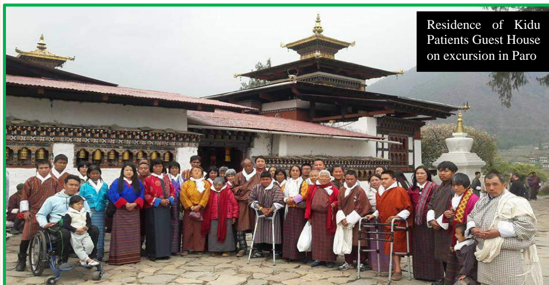
Residence of Kidu Patients Guest House on excursion in Paro

Under Patient Care & Support Programme, the Foundation included a new activity "Patient Nursing Programme".