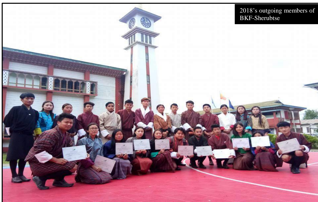
2018's outgoing members of BKF-Sherubtse