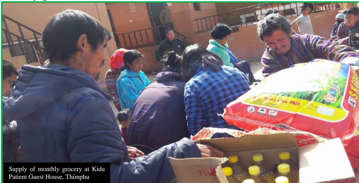
Supply of monthly grocery at Kidu Patient Guest House, Thimphu

The supports are extended either directly or through partnerships with or referrals to other service providers mainly focusing on medical, legal, advocacy, counselling, financial support and peer support programs.